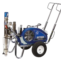
DUTYMAX™ EH300 HD STANDARD