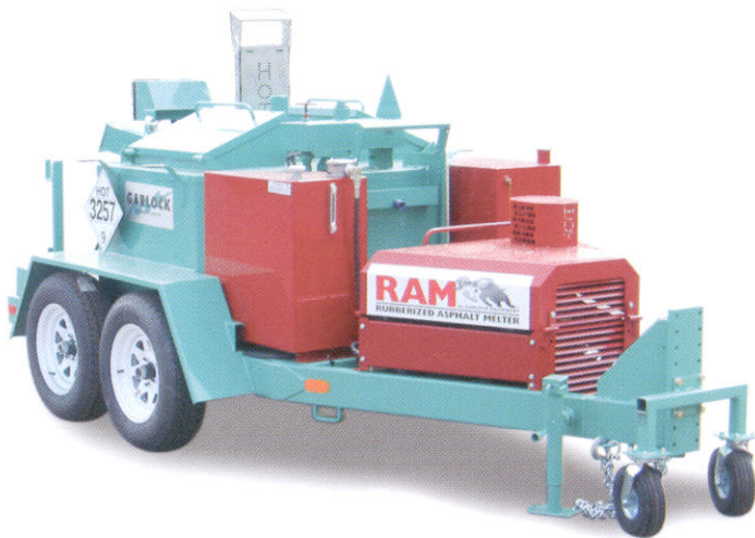
RAM 230 & 410

RAM by Garlock Equipment sets a new standard of efficiency in the heating of heat-sensitive rubberized asphalt materials. Garlock delivers the highest degree of quality construction, productivity and innovation available today. Bottom Line - RAM delivers the best return-on-investment for the money and will continue to make you more money year after year. Check out our features and see why RAM Melters are simply the best!